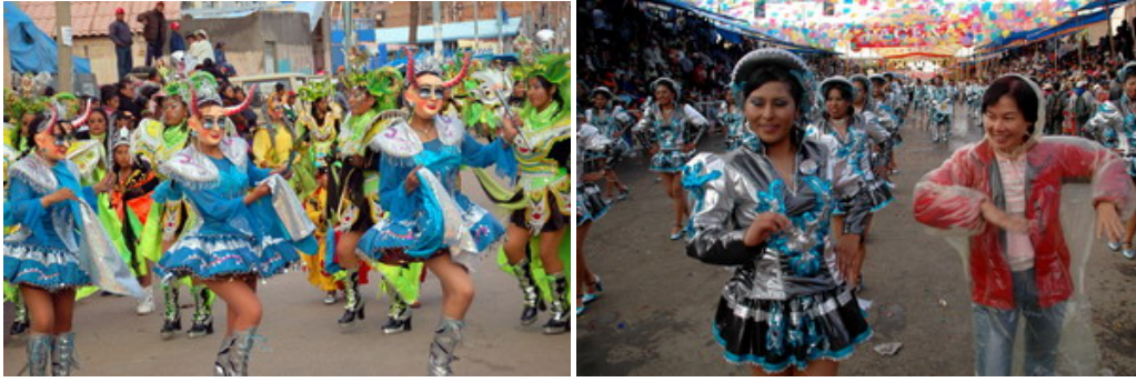
Bolivia Oruro Festival

Day 13 La Paz Market, City Tour, Overnight Bus. Our hotel is near a 3 km long street with a lively and colourful market. Bolivia is one of the poorest countries in South America and the street scenery is very different from that of Lima and other towns in more developed Peru. The morning market is especially attractive with kilometers long stalls exhibiting a wide range of products. At 2pm, we have a half-day City tours USD22 (Mar26) including 5 gondola rides on the largest public transit aerial gondolo system in the world. MEMBERS NOT GOING GET BACK CASH. At night we take an overnight express bus to Uyuni. Half-day tour cost is included in trip cost. ON Bus.