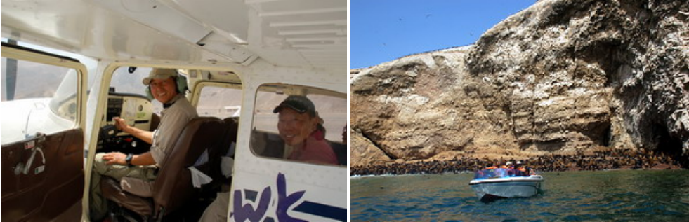
Fly over Nazca Lines / Ballestas Island Sea Lions & seabirds

Day 25 KUL. Lands KUL 0830AM FRI 19 FEB 2027.