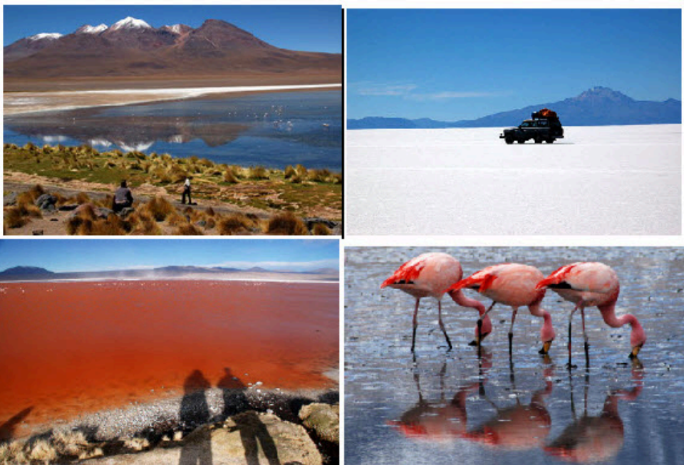
Uyuni Laguna Canapa/ Uyuni Salt Flats / Laguna Colorada / Flamingos

IMPORTANT NOTICE: This is meant to be a "free and easy" adventure trip. Participants should be relatively fit, with a good sense of humor, and above all, have the right attitude for close travel with others through possibly some trying times. Most definitely, this is not a trip for prudes, whiners, fuss-pots, and other similarly assorted types! We had a couple of those before and it wasn't pleasant for us or them. Although every effort will be made to stick to the given itinerary, ground conditions may change and cause some disruption and/or deviation from the norm.