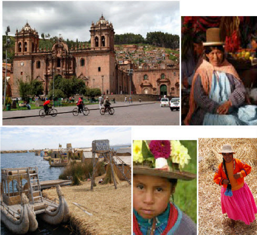
Capital of Incas CUSCO / Locals / Reed boat at Lake Titicaca

Day 6 Chincero Market, Moray & Maras Salt Pans. Early start to Chincero Village, a typical Andean village for its less touristic and colourful Sunday Market. Goods are better priced here and much of the money goes directly to the villagers who make them. We then visit the 700m long salt pans of Maras, which for centuries, have been producing salt. Moray Amphitheatre, a mind-boggling Inca construction of huge circular terraced depression believed to be for agricultural experiments. Finally to Ollantaytambo ruins - said to be the biggest pueblo (town) in the Inca empire at one time. From here we board the 4pm train to Aguas Calientes, the town at the bottom of Machu Picchu, arriving at 6pm. ON Aguas Calientes.